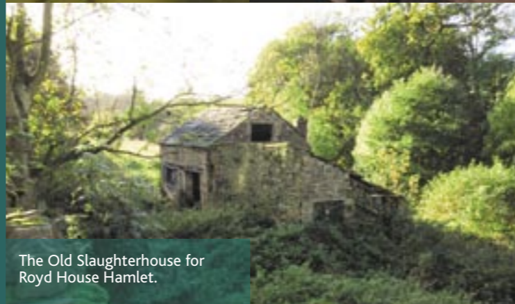
The Old Slaughterhouse for Royd House Hamlet.