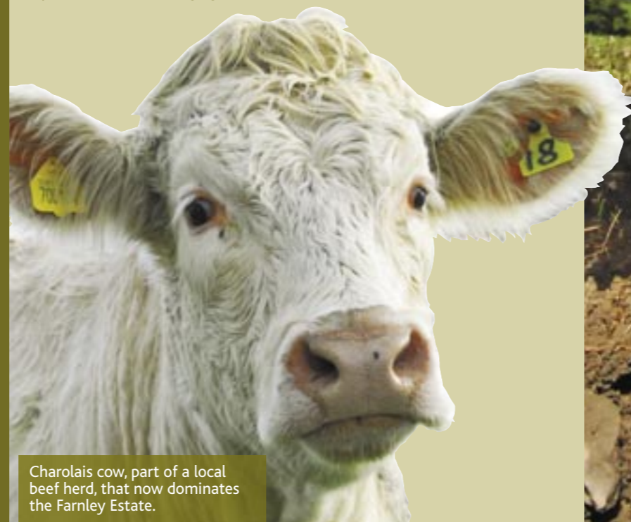
Charolais cow, part of a local beef herd, that now dominates the Farnley Estate.

Since 1968 there has been considerable amalgamation of what had been small family dairy farms, with milk or milk produce going directly to the boroughs of Huddersfield and surrounding areas. The financial returns from milk production have been negative in some of the last ten years. The cost of replacing out dated infrastructure and the difficulty in merging areas of current Estate land has meant that since 2001, there has been no milk production at Farnley Tyas.